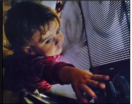
2017 Best of Category Photos