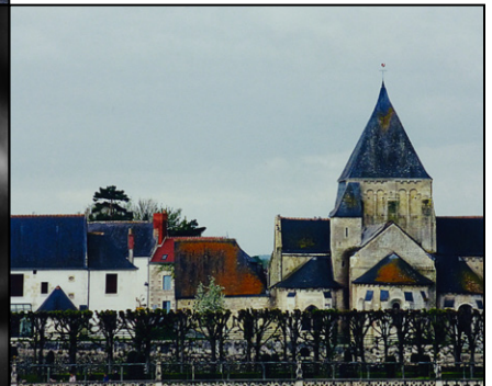
Photo Turn-in Dates Thursday, February 1 - Saturday, February 17, 2018